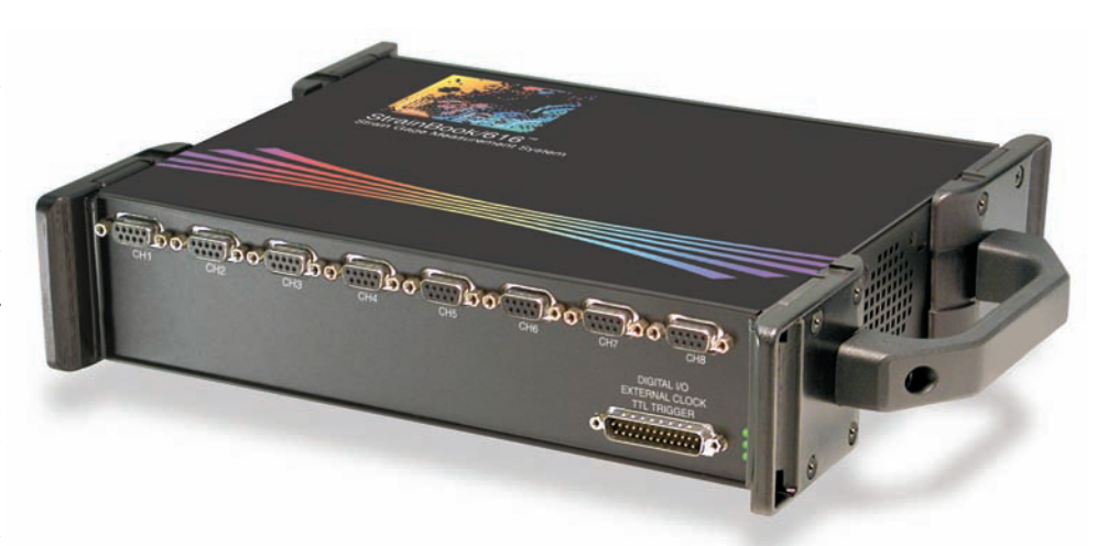
The Ethernet-based StrainBook/616 provides from 8 to 64 channels of automated bridge measurements

StrainBook/616 is a compact and portable strain gage measurement system that connects to your PC's Ethernet port. Eight channels of strain measurement are built into the StrainBook, and up to 64 channels can be measured with one StrainBook using 8-channel WBK16 options. For applications with more than 64 channels, multiple StrainBook systems can be combined and synchronized for a virtually limitless number of strain measurement channels. The StrainBook is also capable of measuring voltage, temperature, vibration, and sound using other WBK signal conditioning options.