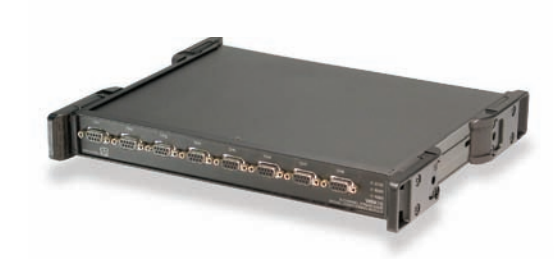
The WBK16 provides eight channels of strain gage input