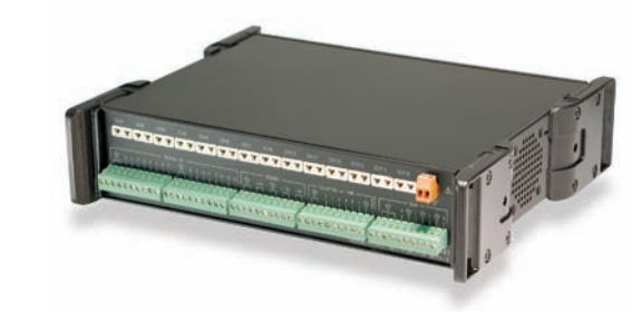
The WBK41 provides thermocouple and counter inputs (not supported in WaveView)