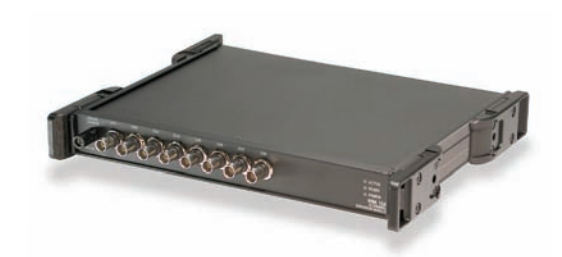
The WBK10A adds eight differential analog inputs

* The CN-115 header is used for axial leaded bridge completion resistors. The CN-115-1 can be used with both axial leaded and upright (square) precision resistors. See user's manual for assembly instructions.