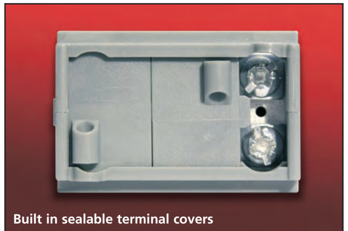
Built in sealable terminal covers