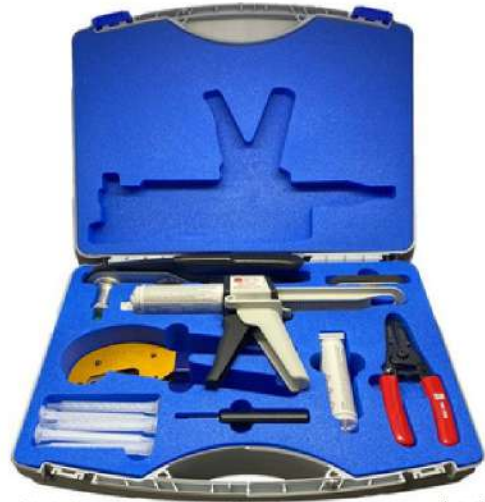
Shown above: CMCP600C-K Connector Tool Kit

Click here for the CMCP60C-K Connector Tool Kit data sheet!