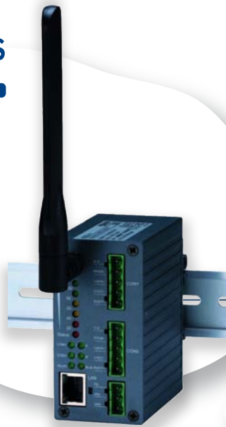
Wireless Serial Server - 802.11g/b